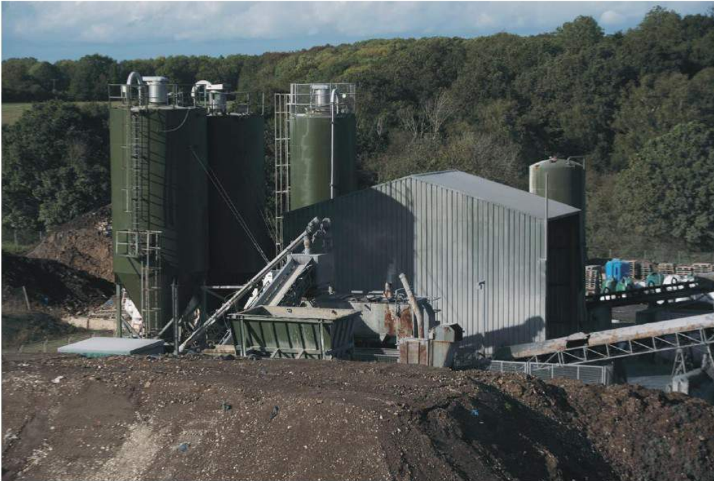
Waste Treatment and Recovery Facility

The site receives a wide range of primarily industrial waste such as contaminated soils, stabilised wastes and residues from waste treatment and recovery operations. Strict site rules mean that no liquids, explosive, flammable, oxidising, corrosive or infectious wastes are accepted for disposal at landfill sites.